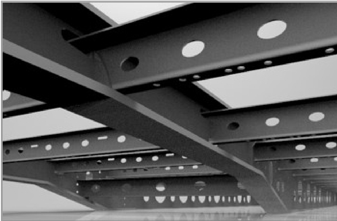
Lightweight frame: Finite element method calculations and road tests confirm its stability.