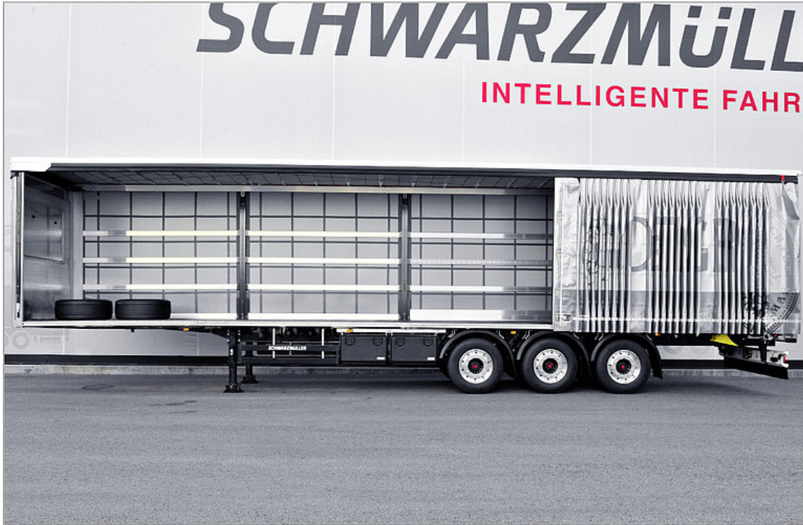
OPTIONAL: Quick slider: System for opening or closing the side tarpaulin within 5 seconds.