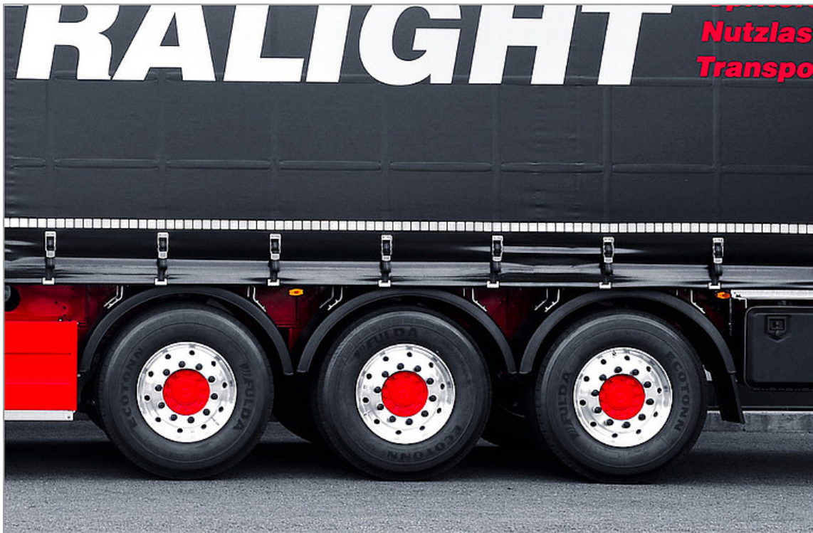
Single wheel mudguards: Reduce water spray caused by wheels rolling on wet roads and protect the underside of the floor.