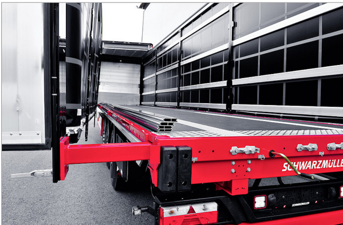
OPTIONAL: Portal frame with crank: Crank out the rear corner posts to generate more loading width at the rear end.