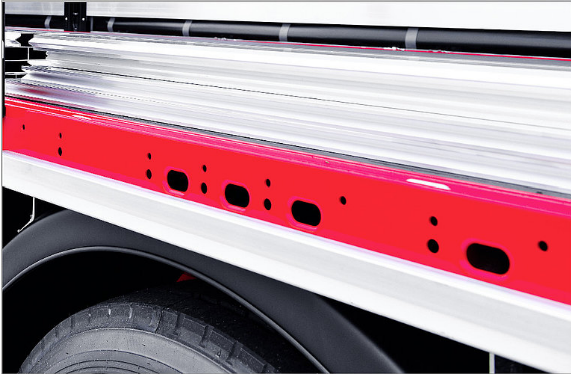
Perforated external frame: The perforated external frame not only allows for the lashing points but also for hooks for securing the cargo at any point.